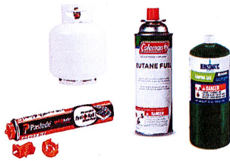
Right: Images of items that are never to be thrown away or recycled.

While some Solid Waste Authorities do accept them at their drop-off locations, others do not which can make disposal tricky. It is imperative these gas tanks are disposed of properly because they are a fire hazard.