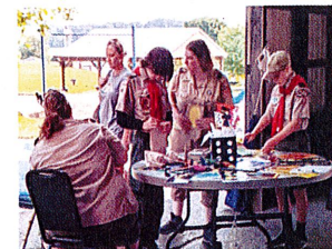
Left: A Scout Troop setting up for National Night Out.